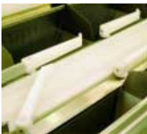
Customised handling systems

Customised infeeds for fresh or frozen products after fully or semi-automatic feeding, a choice of pvc or plastic modular belt conveyor and drag or deflect product ejector arms.