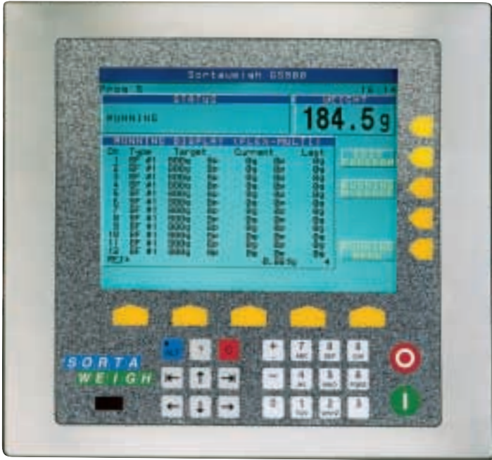
Powerful microprocessor control

Line layouts, conveying and handling systems are custom-designed, with 2 to 32 channels mounted according to application, volume and space requirements. Dual lane configurations are available for high volume throughputs, and takeaway conveyors can be fitted for transporting graded product to end of line bagging or boxing equipment.